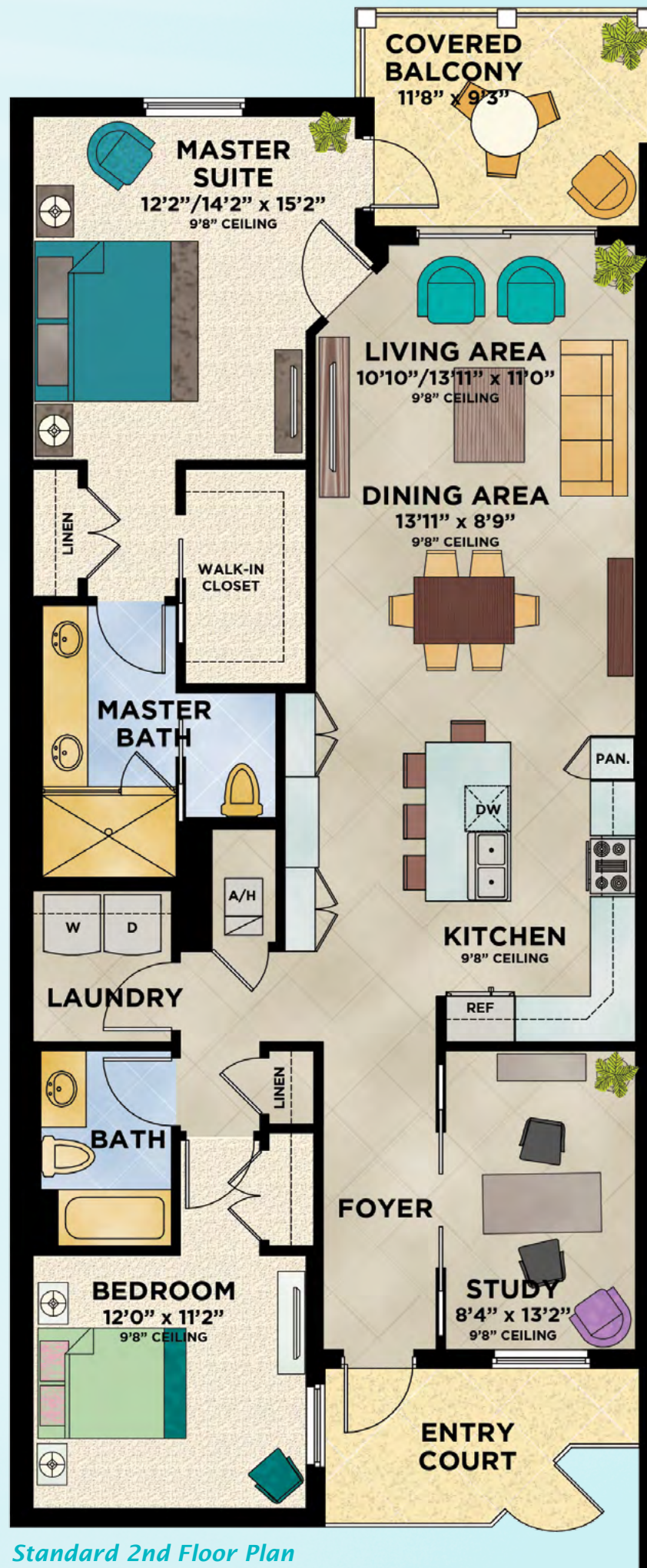
Standard 2nd Floor Plan